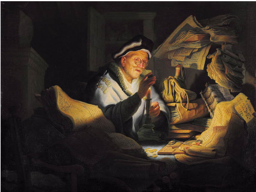
The Parable of the Rich Fool by Rembrandt, 1627.

16 Then he told them a parable: “The land of a rich man produced abundantly. 17 And he thought to himself, ‘What should I do, for I have no place to store my crops?’ 18 Then he said, ‘I will do this: I will pull down my barns and build larger ones, and there I will store all my grain and my goods. 19 And I will say to my soul, Soul, you have ample goods laid up for many years; relax, eat, drink, be merry.’ 20 But God said to